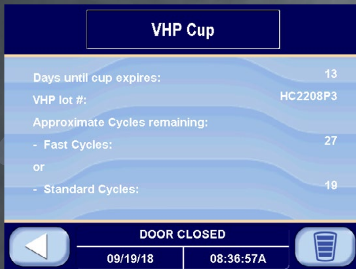
VAPROX HC Sterilant Smart Cup information on the V-PRO maX 2 and s2 Low Temperature Sterilizers